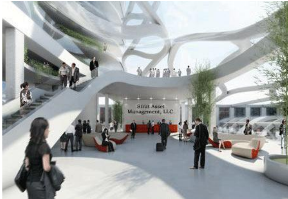
Commodity Trading Advisor Presentation

THE COMMODITY FUTURES TRADING COMMISSION HAS NOT PASSED UPON THE MERITS OF THIS PRESENTATION NOR HAS THE COMMISSION PASSED ON THE ADEQUACY OR ACCURACY OF THIS INFORMATION.